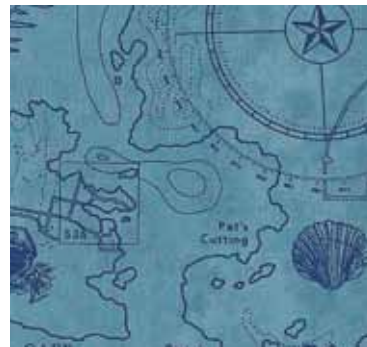
*699/B5 TONAL MAP