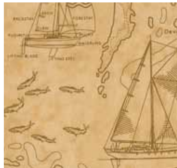
699/Q6 TONAL MAP