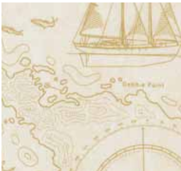
699/Q TONAL MAP