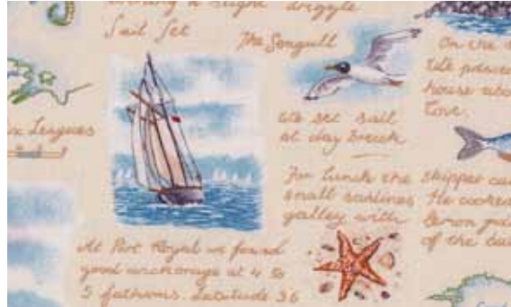
693/1 SHIPS LOG