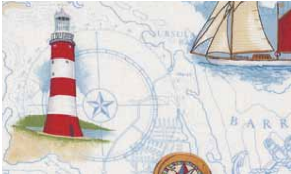
*692/1 SEA CHART