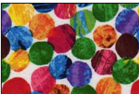
*3474 M Spot