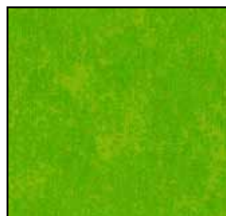
2800 GO2 SPRAYTIME