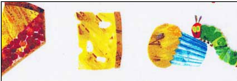
*NEW 5282 M Food