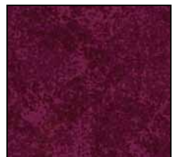
*2800 LO7 SPRAYTIME