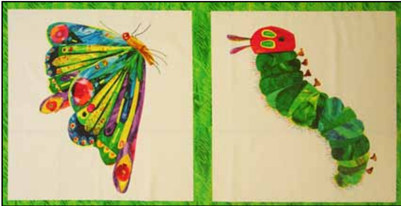
*NEW 5280 M Panel (60cms / 24" Repeat)