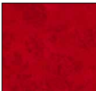
*2800 RO6 SPRAYTIME