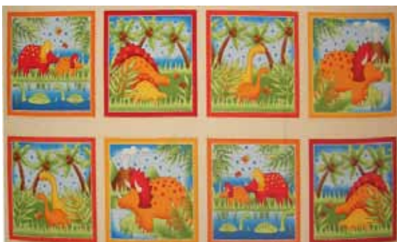
679/1 10"/25CMS PICTURES PANEL REPEAT 24"