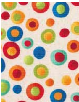
674/Q SPOT CREAM