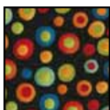
Dino Spots Black Fabric

- Use fabric to piece nine Dino Track blocks with the Dino Skin Blue fabric (directions to follow)