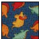
Dino Scatter Blue Fabric

- Rotary cut two squares 5¼" x 5¼", then rotary each of these diagonally in half, cutting each square into two triangles. These four triangles will be used as corner setting triangles for the quilt blocks.