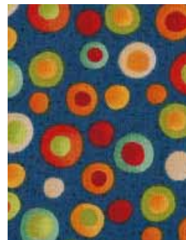
674/B SPOT BLUE