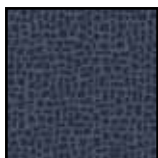
Dino Skin Blue Fabric

- use fabric to piece nine Dino Track blocks with the Dino Spots Cream fabric ( directions to follow)