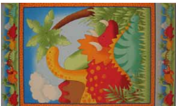
678/1 LARGE SCENIC PANEL REPEAT 24"