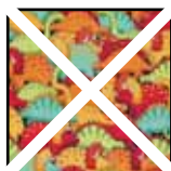
Dino Crowd Fabric

- Rotary cut five squares 9¾" x 9¾", then rotary cut each of these diagonally into quarters, cutting each square into four triangles - eighteen of these will be used as setting triangles on sides, top, and bottom of quilt