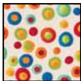
Dino Spots Cream Fabric

- Rotary cut five strips 2½" wide x WOF (width of fabric) to use in binding the quilt.